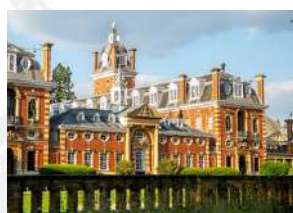
Wellington College United Kingdom

Families join a warm international community, united by shared values and a sense of belonging, where every voice is welcomed and supported.