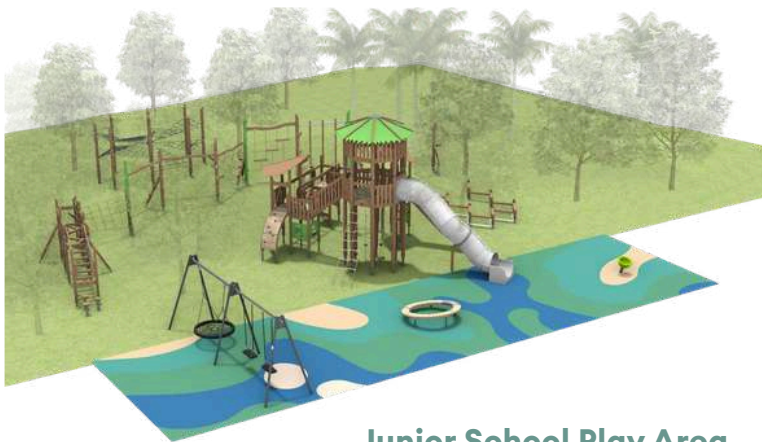
Junior School Play Area

Both playgrounds feature partially shaded areas, offering space for active play as well as quieter moments to rest and reconnect. Pupils have room to run, climb, build, imagine and create, with each day filled with movement, exploration and joy.