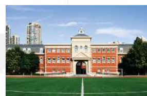
Wellington College International China Tianjin, Shanghai, Hangzhou, Nantong