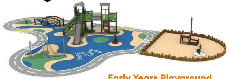
Early Years Playground

Our outdoor spaces are thoughtfully designed to develop imagination, resilience and joy. We have a dedicated Early Years playground for sensory and exploratory play, and a Junior School play area designed for challenge, teamwork and active movement.