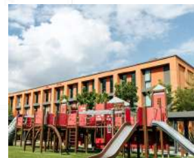
Wellington College International Bangkok Thailand